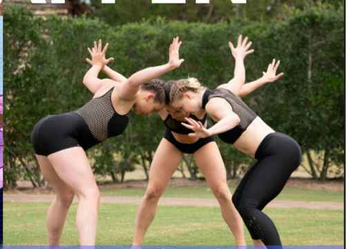
Grants for Artists & Organizations