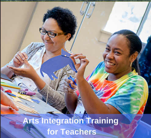
Arts Integration Training for Teachers

Building a better Wake County through the arts