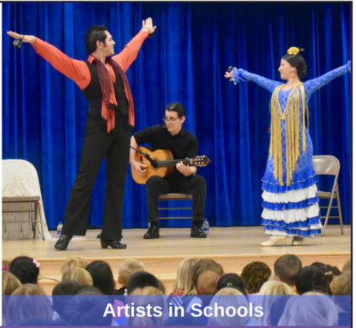
Artists in Schools